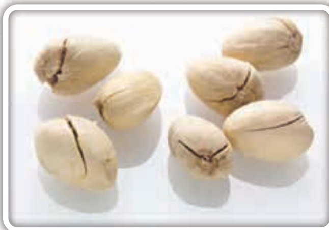
NO SPLIT ON SUTURE